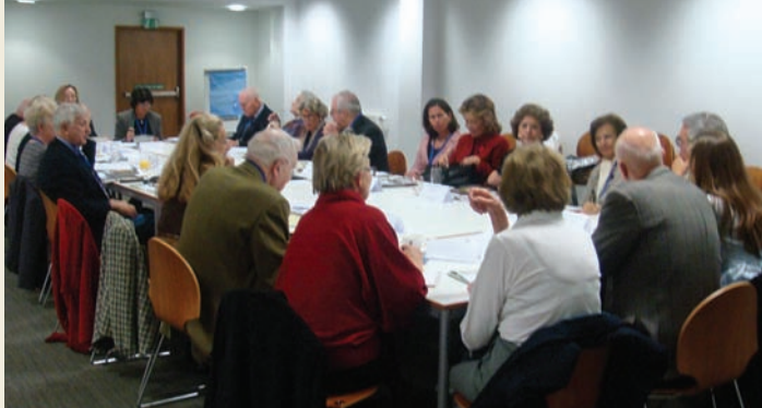
Council Meeting at Kelvingrove in Glasgow

The closing General Assembly, open to all members and guests present in Glasgow, featured reports for the year from all national Presidents.